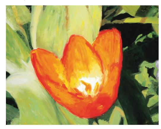
Red tulip, Oil on canvas, 2002. 90 \times 70 cm