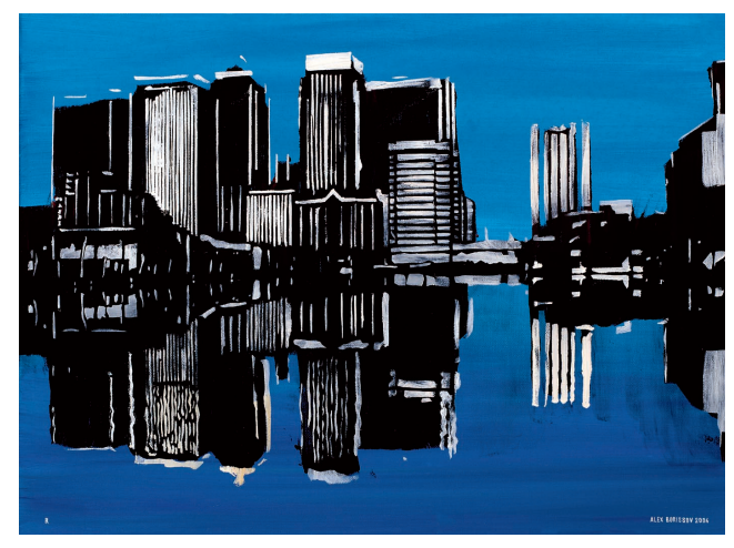
Canary Wharf Landscape, Oil on canvas, 2004. 60 x 40.5 cm

For more information please visit www.eulerhermes.com/uk or call 0800 056 5452.