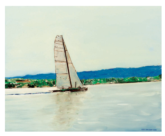
Racing Boat One, Oil on canvas, 2004. 51 x 40.5 cm