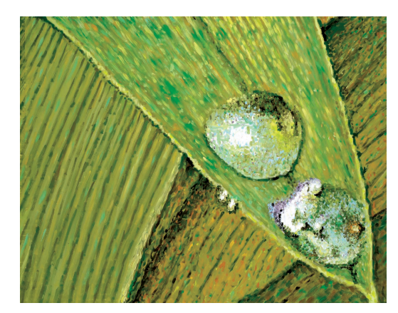
Tulip and Dew, Oil on canvas, 2002. 90 x 70 cm