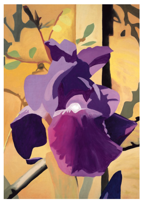
Iris, Oil on canvas, 2002. 70 x 100 cm