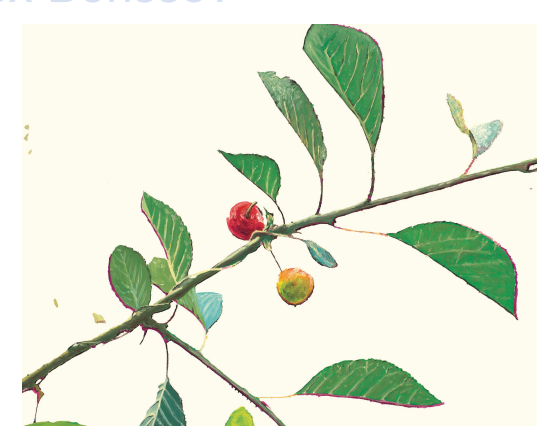
Cherries, Oil on canvas, 2002. 90 x 70 cm